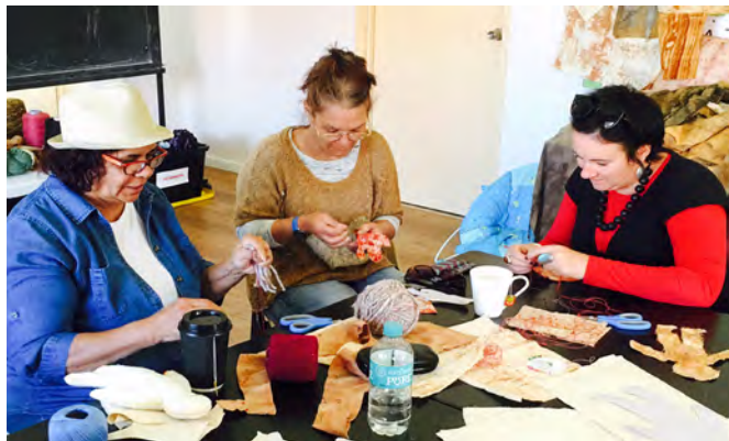
Front Cover: Nyungar Doll Project October 2016