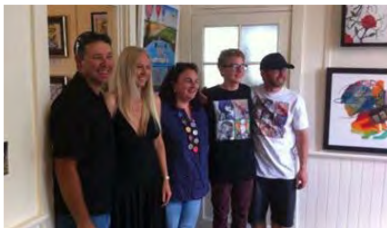
Art Space & Gift Shop

ECA continued to work with member organisations and other groups to explore potential partnerships and to broaden arts programming relevance and connection to the community. Providing opportunities to incorporate and support arts programs that are inclusive and participatory for all people, no matter what their age or ability.