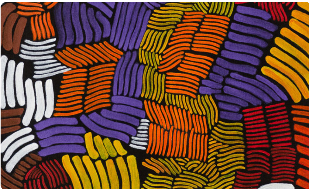
Painting by Agnes Kohler, Burrkunda (My Mother's Country)

The island has a long tradition of creative arts production and performance in music, visual arts and dance. The renowned Mornington Island Dancers performed at the Sydney Opera House opening ceremony in 1973. The Mornington Island Art Centre is one of the longest established Aboriginal art and cultural organisations in Australia and includes an artist studio currently supporting about 25 artists.