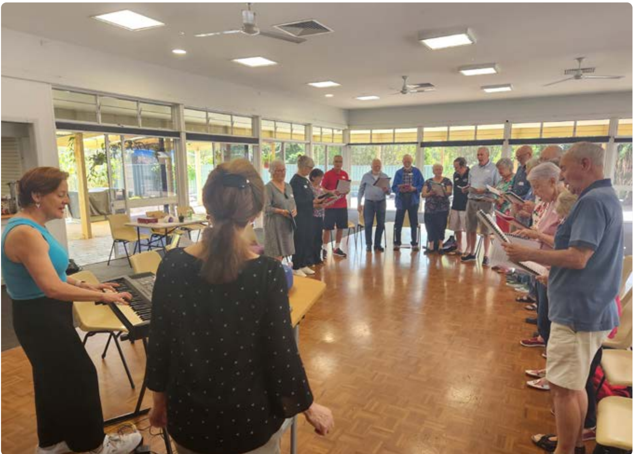
The Logan Dementia Choir.